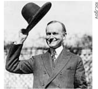
President Calvin Coolidge

Before World War One, foreigners invested more money in the United States than Americans invested in other countries -- about three thousand million dollars more. The war changed this. By nineteen nineteen, Americans had almost three thousand million dollars more invested in other countries than foreign citizens had invested in the United States.